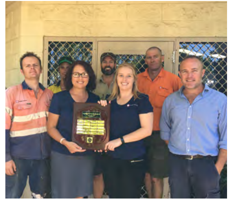
Winners of the 2017 Safety Culture Award - Townsville Branch

Safety leadership is recognised and rewarded at all levels throughout Douglas Partners.